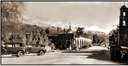
The Ojai Arcade, Landmark No. 5